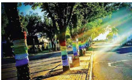
Devon Pride Week featured on Global National

Devon Pride week featured free activity kits for residents and online presentations throughout the week with the theme of learning more about the LGBTQ2S+ community.